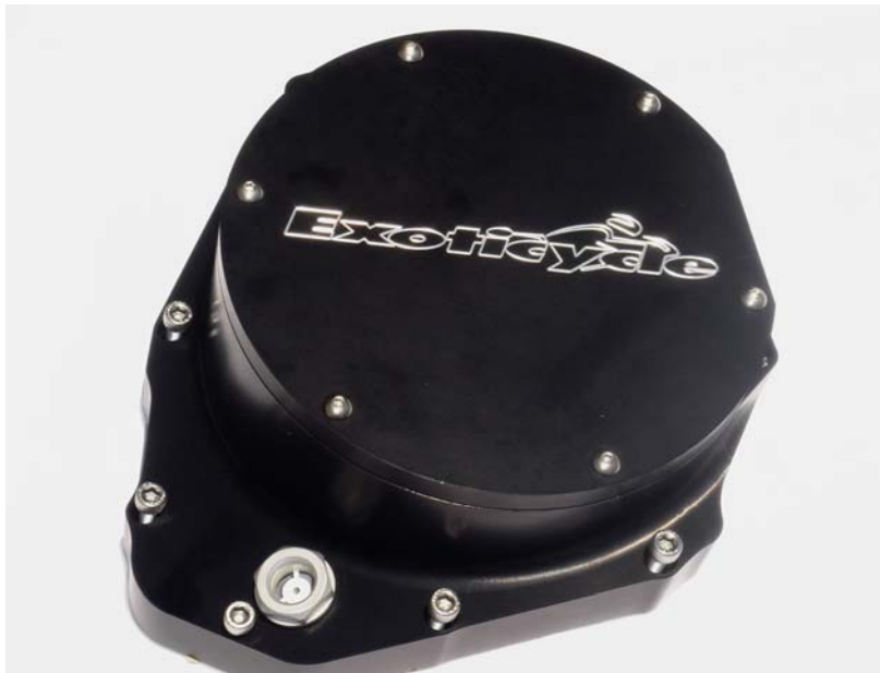
GSXR Clutch Access Cover. 2001-2008 1000 CC Models.