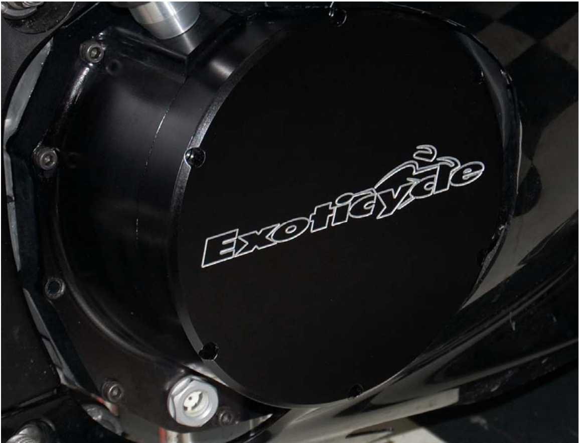
99-09 Hayabusa Clutch Covers $489